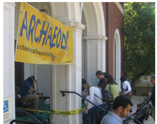
Flintknapping on the front porch