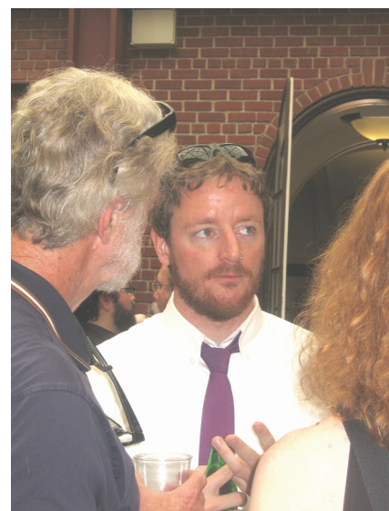
Andrew Roddick, above