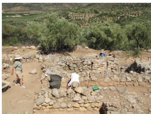
Excavations at Petsas House in progress.

ber—a full report and many pictures will be presented at Nemea Night.